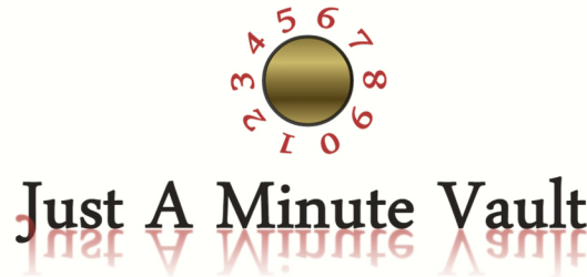
iii) Designer #1, Logo 3

I asked him what the circle was with numbers around them (a vault representation?) I asked for a little more work, but told him I didn’t feel he was moving in the right direction and it wasn’t something I could use. He said he was sorry and he would provide a refund if I wanted. (I let him keep the money). But thanks, anyway.