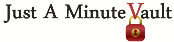
ii) Designer #1, Logo 2

Then I received the revision of the logo from Designer #1 (see picture ii). “Well,” I thought, “it IS more of what I asked for...” But the color was off, and the lock felt silly, but at least it was moving in the right direction.