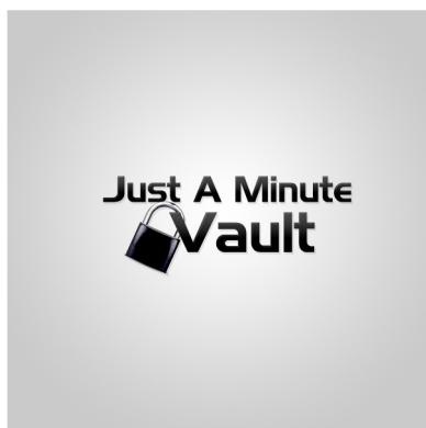
b) Designer #2, logo 2

He responded quickly, and sent me the second revision of the logo within 1 day. (see picture b)